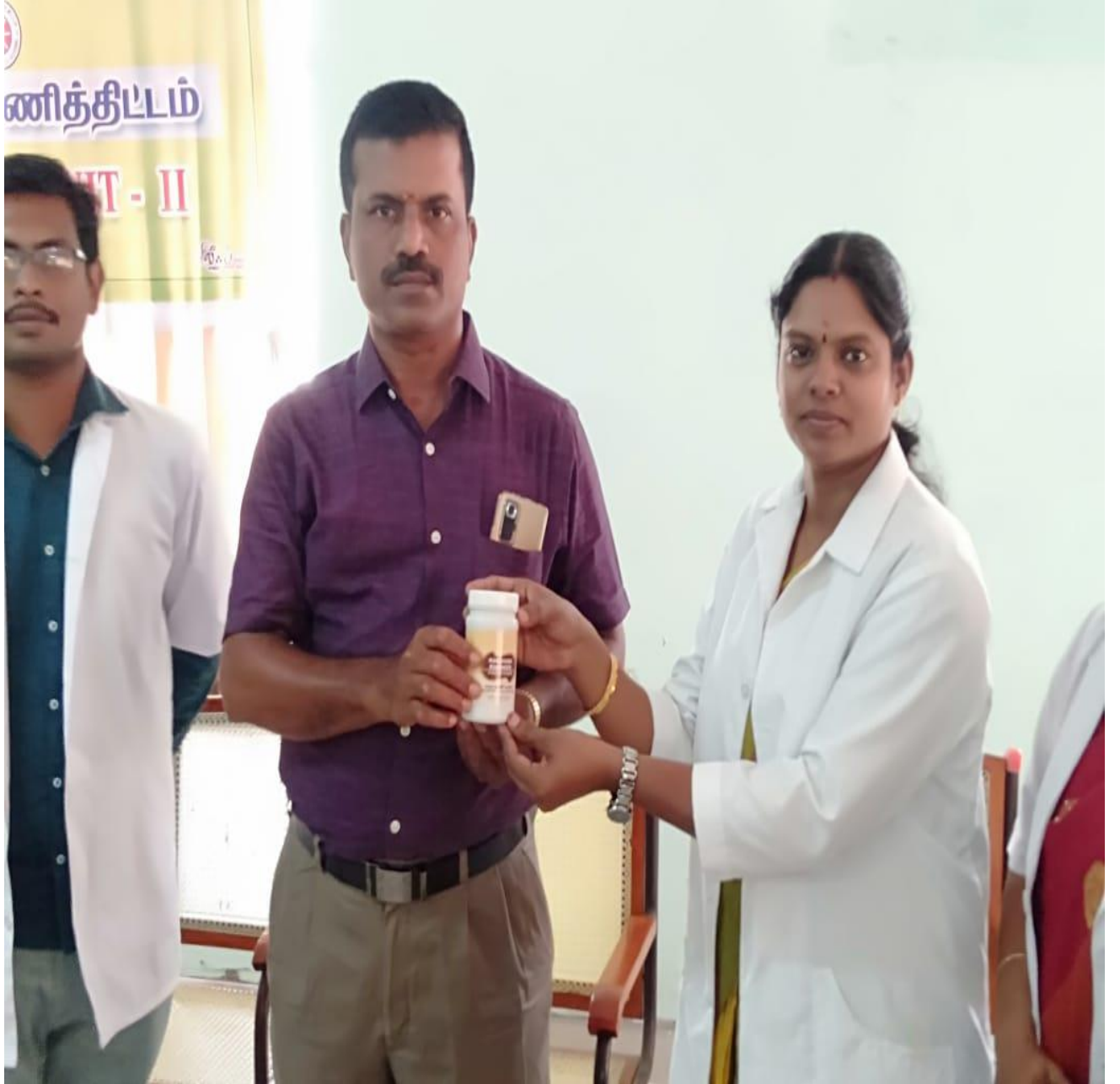
Kabasura Kudineer Chooranam given to the Principal

The queries asked by them were clarified by the medical team. After the Awareness speech Kabasura kudineer was distributed to all.