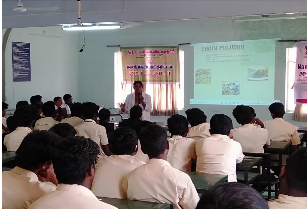
Queries clarified by the team