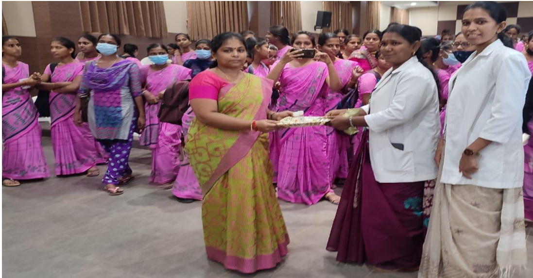
Medicines given to the teaching staffs

The college students, teachers and the management thanked the team for the beneficiary programme. We are also thankful to Ministry of AYUSH for giving this opportunity to create awareness among the rural areas.