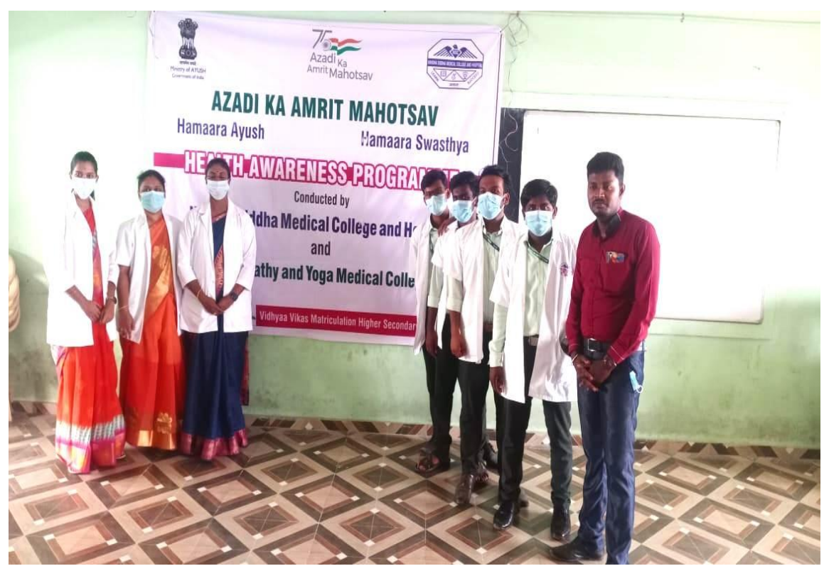
Our Medical Team

AZADI KA AMRIT MAHOTSAV festival celebrates the rapid strides that India has taken in the past 75 years. This festival encourages us to rediscover our hidden strengths of prompts us to take sincere, synergistic action to region our rightful place in the comity of nations. In this regard, NCISM recommended to organize AYUSH Awareness programmes, camps, demonstrations, competitions among higher secondary schools.