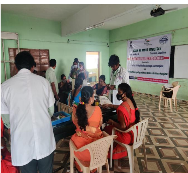
Checking of Clinical Parameters