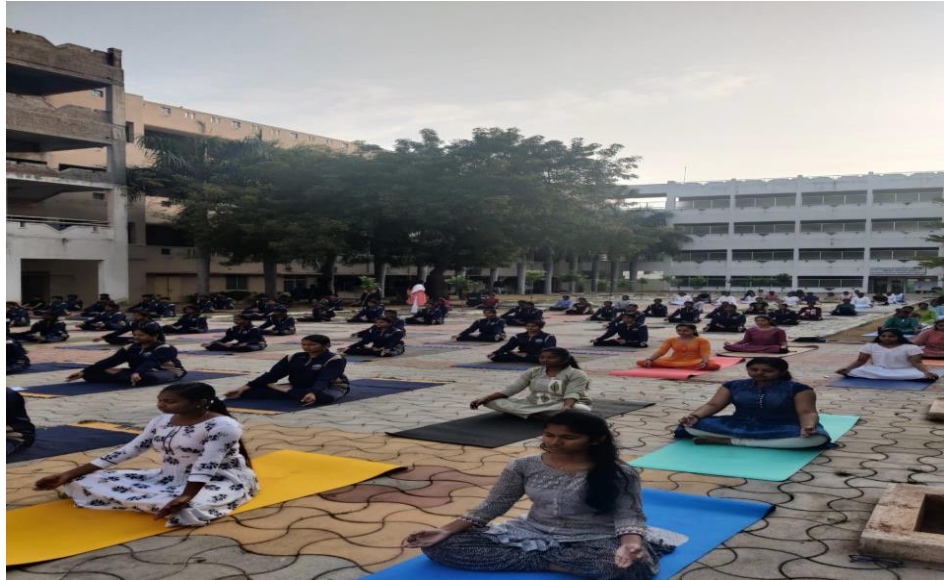
Meditation done by students

She gave a detailed explanation of the 12 steps one by one to the students. And she also described the scientific importance of Surya Namaskar, which has been known to develop immunity and improve vitality to our health during pandemic conditions . This occasion commemorates Thanks giving to Mother Nature for bestowing health, wealth and happiness.